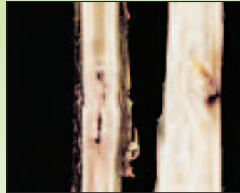
Fig. 7 Mined Canada thistle stem—Hand County