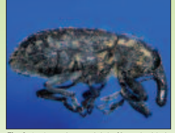
Fig. 8 Larinus planus adult (Canada thistle seedhead weevil)