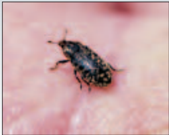
Fig. 12 Rhinocyllus conicus adult (musk thistle seed weevil)