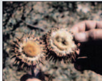
Fig. 13 Left: Normal (musk thistle seedhead); Right: infested musk thistle seedhead