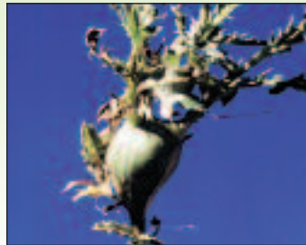
Fig. 10 Gall on Canada thistle stem—Beadle County