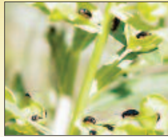
Fig. 3 Aphthona lacertosa flea beetles on leafy spurge