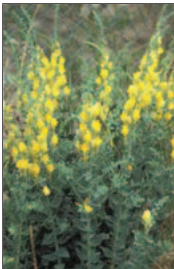
Mature Dalmatian toadflax

Prevention is the best control. Both yellow and Dalmatian toadflax have extensive root systems that make them competitive and difficult to control once they get a start in the field. Maintain the health of desirable pasture plants and avoid overgrazing; toadflaxes like disturbed, overgrazed areas. Herbicide options are available; timing of application depends on the species.