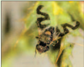
Fig. 9 Urophora cardui (Canada thistle gall fly)