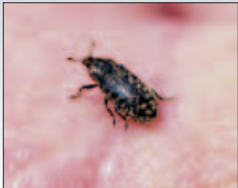
Fig. 12 Rhinocyllus conicus adult (musk thistle seed weevil)