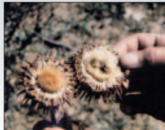
Fig. 13 Left: Normal (musk thistle seedhead); Right: infested musk thistle seedhead