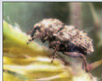
Fig. 14 Trichosivocalus horridus adult (musk thistle rosette weevil)