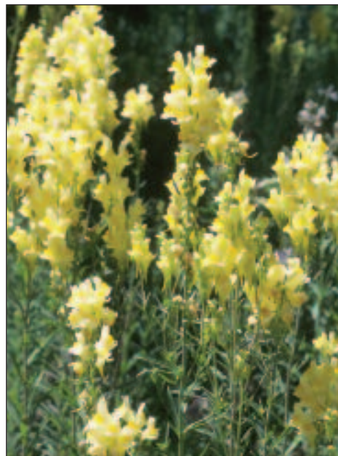
Mature yellow toadflax