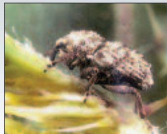
Fig. 14 Trichosivocalus horridus adult (musk thistle rosette weevil)