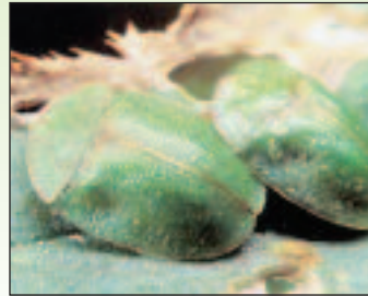
Fig. 11 Cassida rubiginosa adult (defoliating beetle)