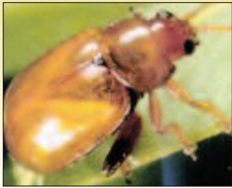
Fig. 1 Aphthona nigricutis adult (brown flea beetle)