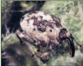
Fig. 5 Hadroplatus litura adult (Canada thistle stem mining weevil)