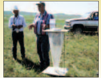
Fig. 4 South Dakota flea beetle collection/beetle sorter