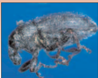
Fig. 15 Larinus minutus adult (flowerhead weevil)